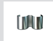
Aggancio sedute Linking device